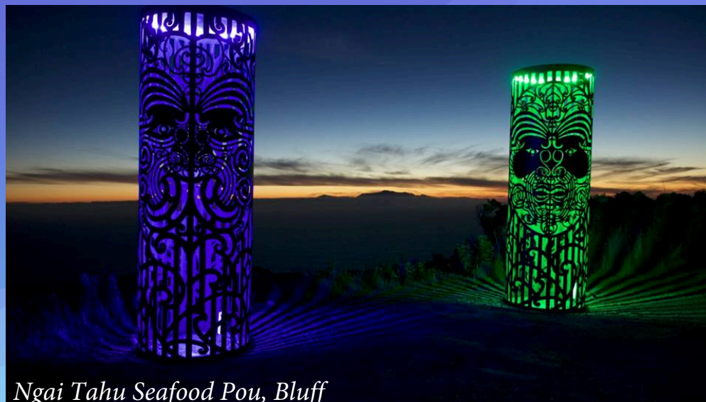
Ngai Tahu Seafood Pou, Bluff Tamarereti & Te Moana Pokopoko o Tawhaki Kaitiaki of the Southern Oceans