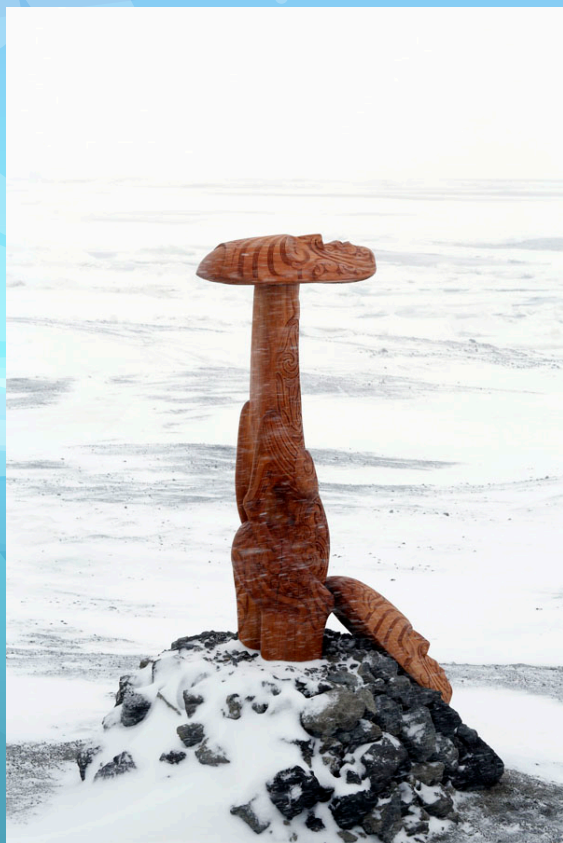
Pou whenua - Navigator of the Heavens