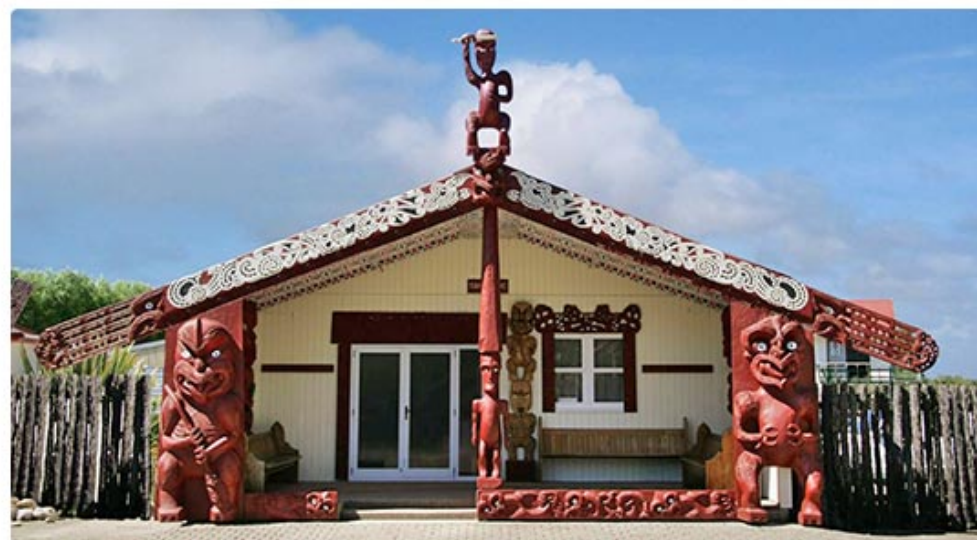
Te Awhini Marae